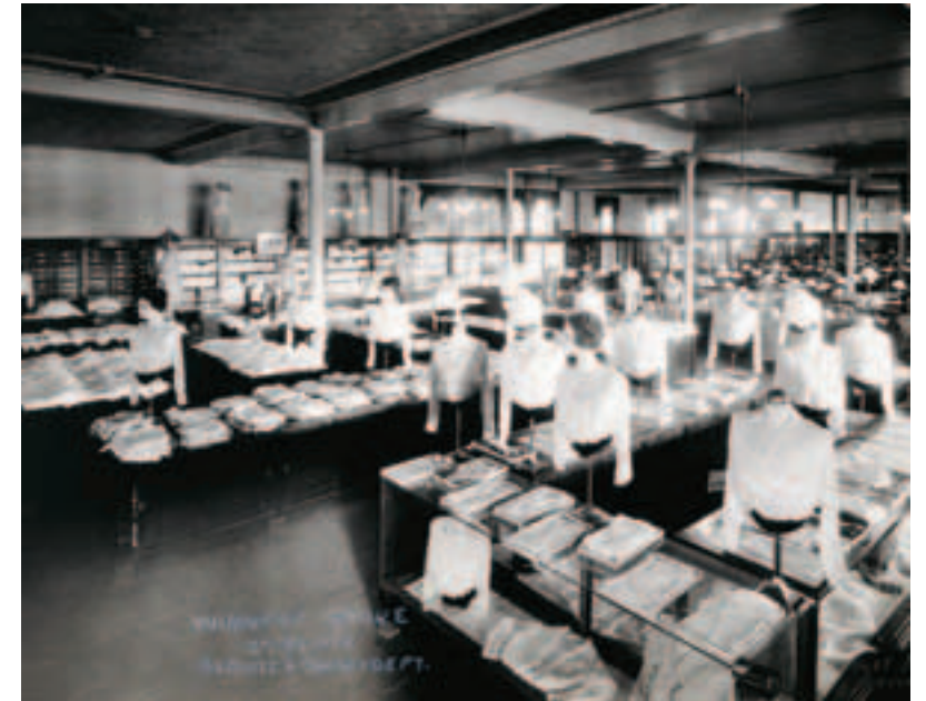
For people who lived far from its modern stores, Hudson's Bay Company published a mail-order catalogue from 1881–1913. (Left) These illustrations of women's fashions from an early catalogue would have matched anything found in the ladies' department of the Company's stores (above).