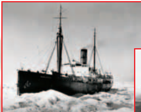
(Left) The Nascopie makes its way through heavy ice. (Below) Early airplanes such as this were used increasingly to carry goods during the 1930s. (Bottom) A Winnipeg Hbc delivery truck from 1912.

In the 1930s, the Company also started to use small airplanes to keep its distant posts supplied. Journeys that had once taken days by canoe or York boat could now be made in hours.