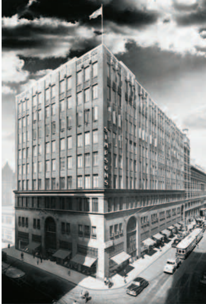
Between 1960 and 1999 the Company expanded its reach by acquiring stores all across Canada. Among these were Morgans, a Montreal retailer since Victorian times (left), and Simpson's, whose flagship Toronto store (above) had long been a city landmark.