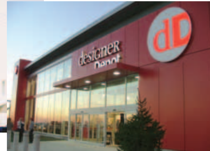
Zellers, acquired in 1978, is today Canada's largest mass merchandise department store chain. Fields is Hbc's discount banner. Hbc has expanded its retail market to include two new specialty stores: Home Outfitters and Designer Depot.