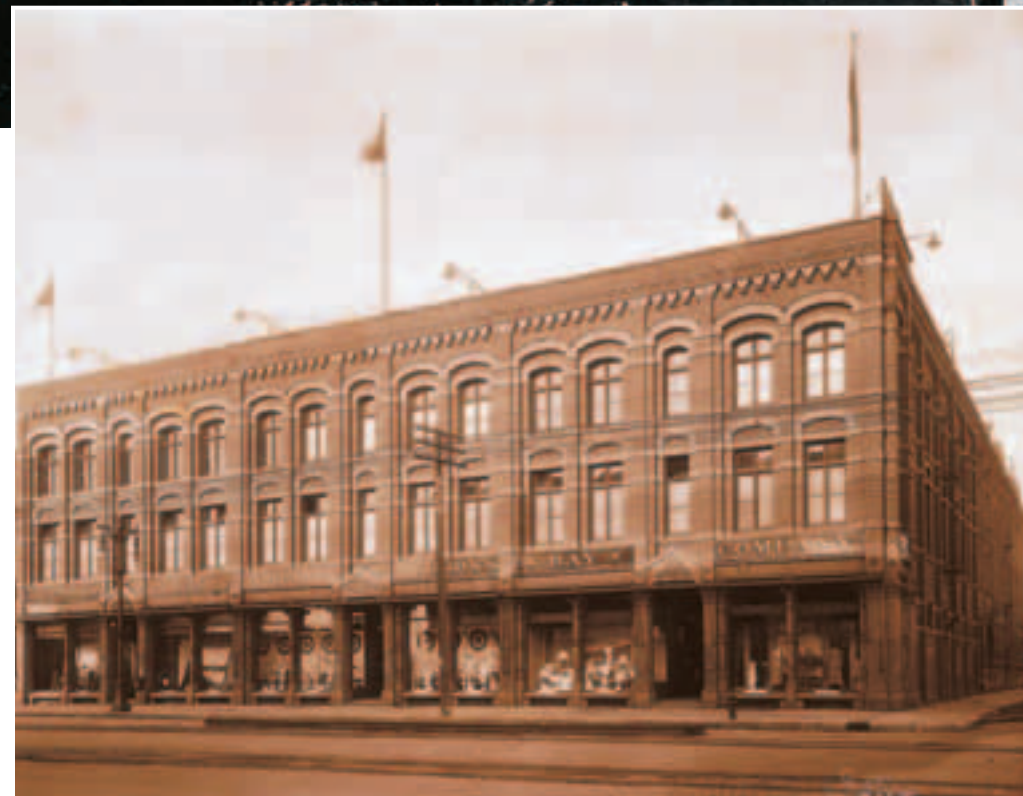
(Left) The first modern Hudson's Bay Company department store. Its displays were more lavish than anyone in Winnipeg had ever seen before, as shown in this photograph (above) from the 1890s.