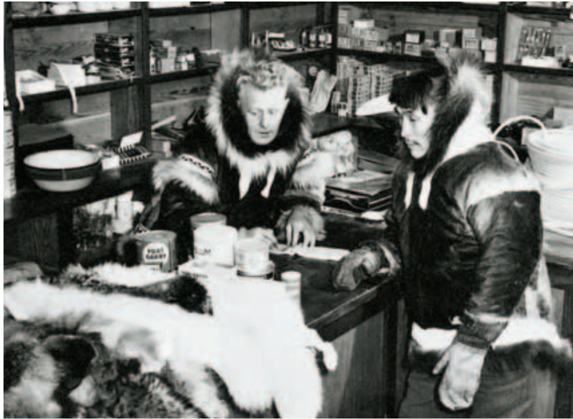
In this 1940s photograph, a Hudson's Bay Company storekeeper and an Inuit trapper barter fox furs for goods. Notice that even the employee is wearing a fur jacket. The Company's posts in the north were often unheated to discourage customers from lingering around a warm store instead of tending their trap lines.